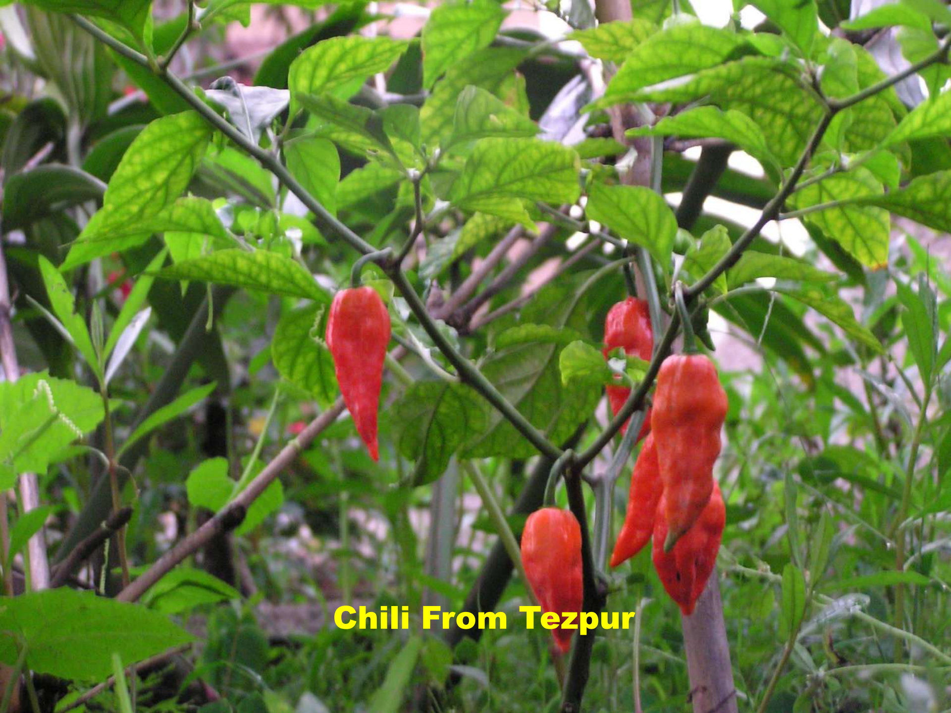
Chili From Tezpur